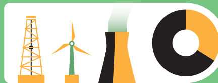
In 2010, buildings accounted for 32% of global final energy use.